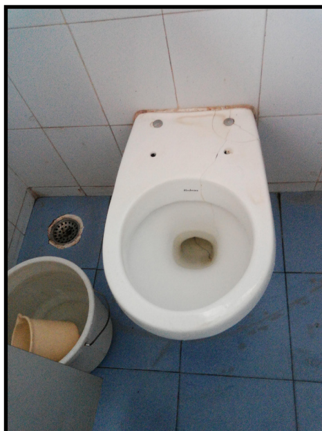
Toilets with no seats in C-block

Margao, 9 July: The students of Chowgule College were recently interviewed about the problems faced in the campus and the most of students that were interviewed students said they face problems with regards to the lack of maintenance of the toilets. According to an ex student of Chowgule College Gretchen Almeida (2014-15) said that during her study period at the college faucets were installed in the girl's washroom but within 2 months they were either broken or uninstalled to avoid further damage. "There is always a problem of lack of water in the boy's washrooms and the janitors don't bother to fill the buckets when not in use use store water before hand." , said